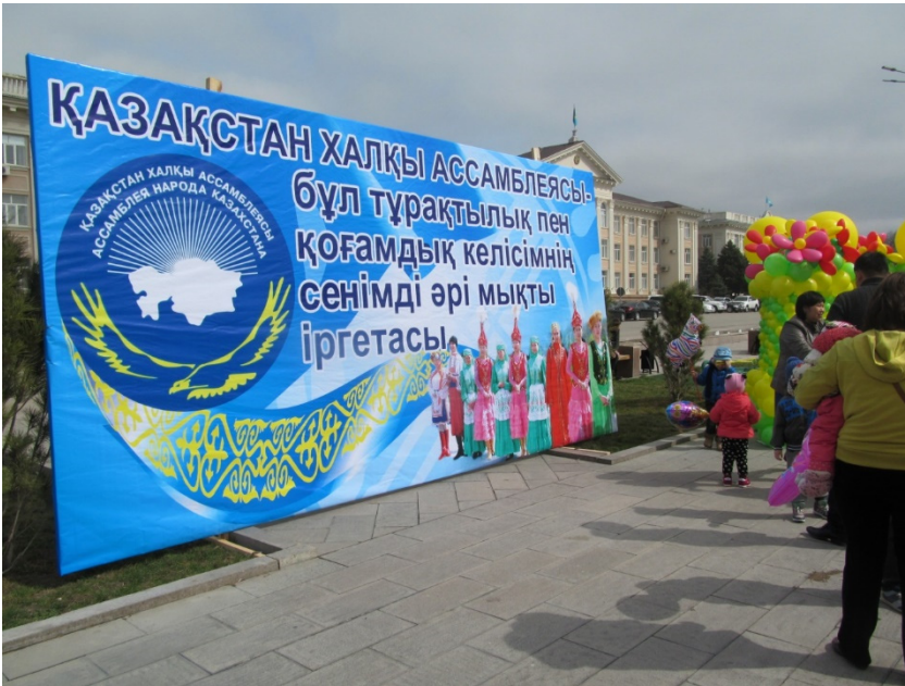
Picture 1. Taraz, March 2014. A Poster of the Assembly of the Peoples of Kazakhstan at the celebration of Nauruz.