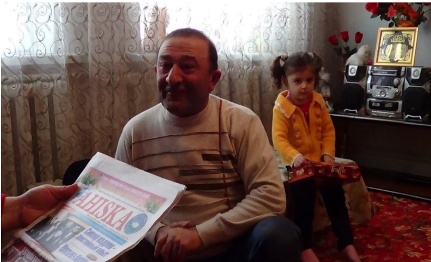
Picture 8. The head of the Taraz branch of the Association of the Ahiska people is showing the participants of the project the newspaper "Ahiska". Taraz, 2014.