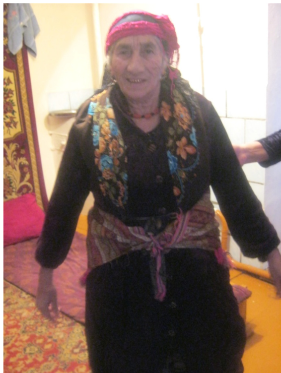
Picture 6. A Shemshili woman. Taraz 2014.