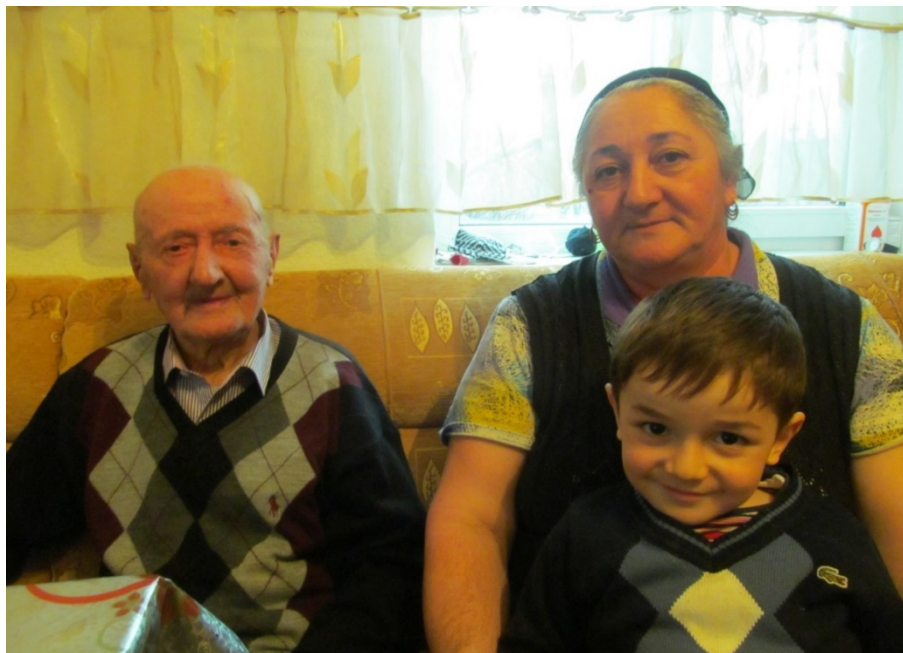
Picture 5. Ahiska people. The village of Merke.