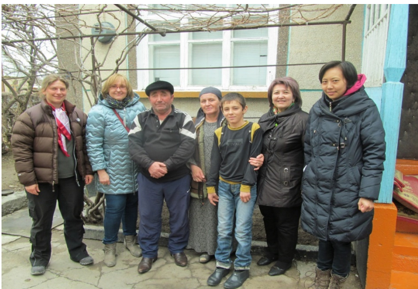
Picture 4. Research in the South of Kazakhstan in March 2014.